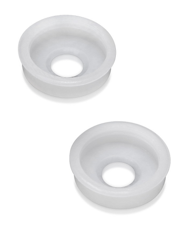
Washer for flat head screw use Item #: W6/8FB