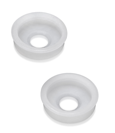
Washer for flat head screw use Item #: W6/8FB