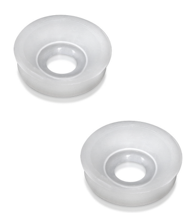
Washer for countersunk screw use Item #: W6/8CS